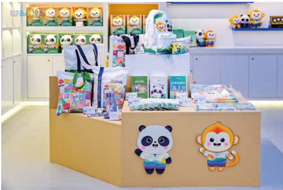
Stationery Section: TWG 2025 Chengdu Mascots-Related Backpack/Canvas Bag/Notebook/ Ballpoint Pen