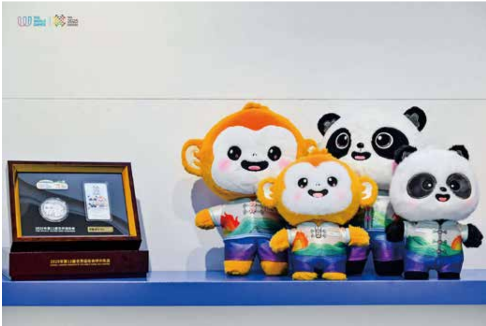
Left: TWG 2025 Chengdu [Impression: Chengdu] Limited Edition Collector's Ornaments Right: Mascot Plush Toys