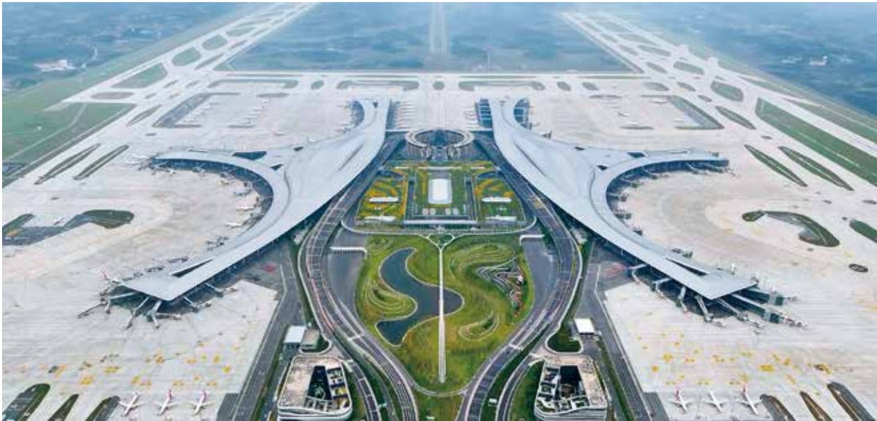
Chengdu Tianfu International Airport

With convenient transportation infrastructure, Sichuan is a transportation hub in southwest China. It has two international airports (Chengdu Tianfu International Airport and Chengdu Shuangliu International Airport), with an annual passenger throughput of 75 million in total. The non-stop high-speed railway service between Chengdu and HKSAR, China has been provided since 1 July 2023, with a total of 1.5 million passengers transported so far. In addition, it runs nearly 30,000 trips made by the Chengdu International Railway Service.