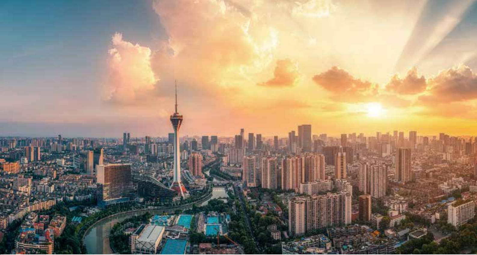
Streetscape of Chengdu