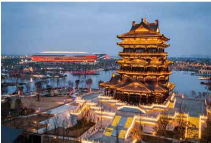
Dong'an Lake Sports Park