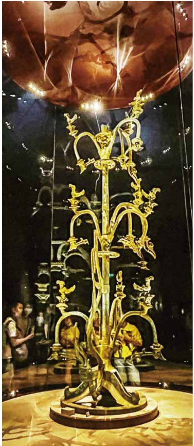
Sanxingdui Bronze Sacred Tree

The province also abounds in tourism resources, among which there are World Natural Heritage Sites including Jiuzhaigou Valley, Huanglong Scenic and Historic Interest Areas and Sichuan Giant Panda Sanctuaries, the World Cultural Heritage Site, Mount Qingcheng and the Dujiangyan Irrigation System, and the World Cultural and Natural Heritage Site, Mount Emei Scenic and Leshan Giant Buddha Scenic Area.