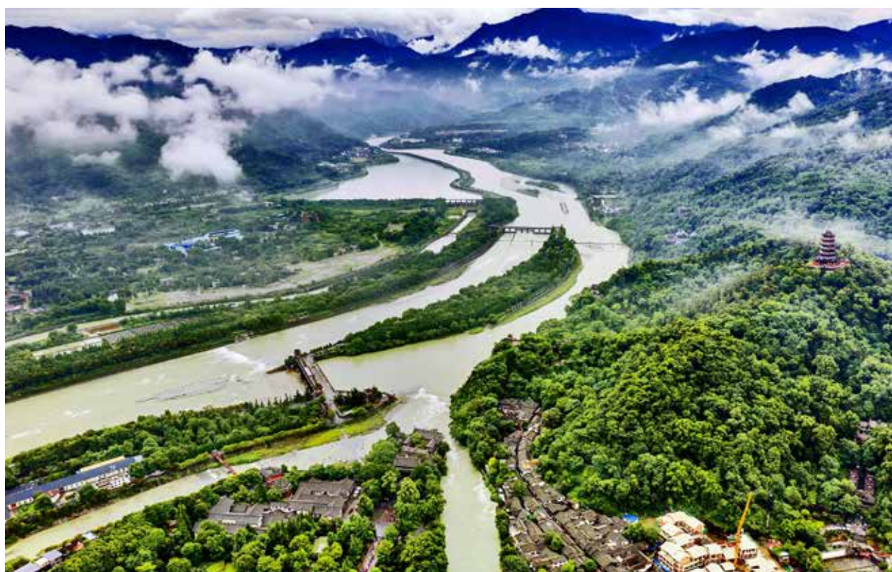
Dujiangyan Irrigation System