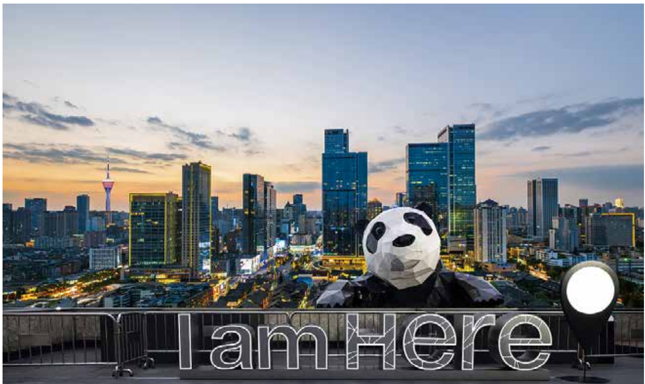
Streetscape of Chengdu

Chengdu is the hometown of the Giant Pandas and enjoys over 4,500 years of civilisation history and more than 2,300 years of history as a city, manifesting a perfect mixture of history, culture and modernity. Being the capital of Sichuan Province and a central city in southwest China, Chengdu covers an area of 14,300 square kilometres and has a permanent population of 21.4 million, which has turned it into a mega-city known to the world. It is also an important centre of economy, science and technology, finance, cultural creativity, and international exchanges in China, and an international hub for comprehensive transportation and communications.