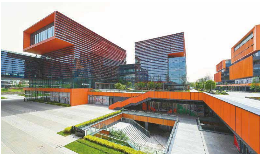
Main Media Centre

On the periphery of the MMC, there will also be a media transportation hub to provide shuttle buses travelling to and from the media hotels, media centers in competitions venues and VOCs of non-competition venues including the venues for opening and closing ceremonies. Technological support will be provided in all respects, including “media+” dedicated communication, broadcast convergence network and competition live-streaming to new report and broadcast.