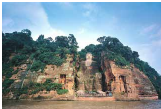
Leshan Giant Buddha