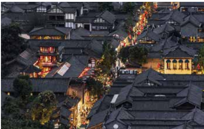
Taikoo Li Chengdu

Today's Chengdu values opening up with global vision. In total, 23 countries have been approved to establish consulates in Chengdu. And the city has established sister-city and friendship city relations with 112 cities around the world, and trade relations with 235 countries or regions worldwide. Chengdu is the third city having two international airports on the Chinese mainland, following Shanghai and Beijing, and the 19th city with two 4F airports in the world. It has opened 71 regular international/regional passenger and freight flight routes. In addition, it runs trips to 112 overseas cities made by international railway services.