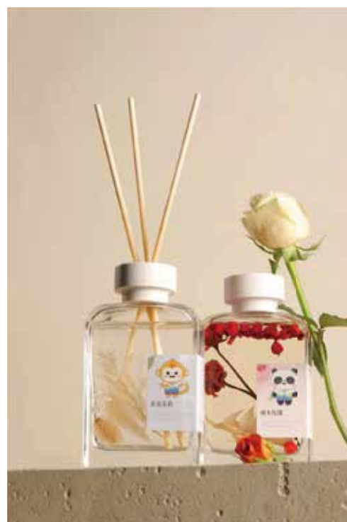
Nature & All Things: TWG 2025 Chengdu Aromatherapy Scents