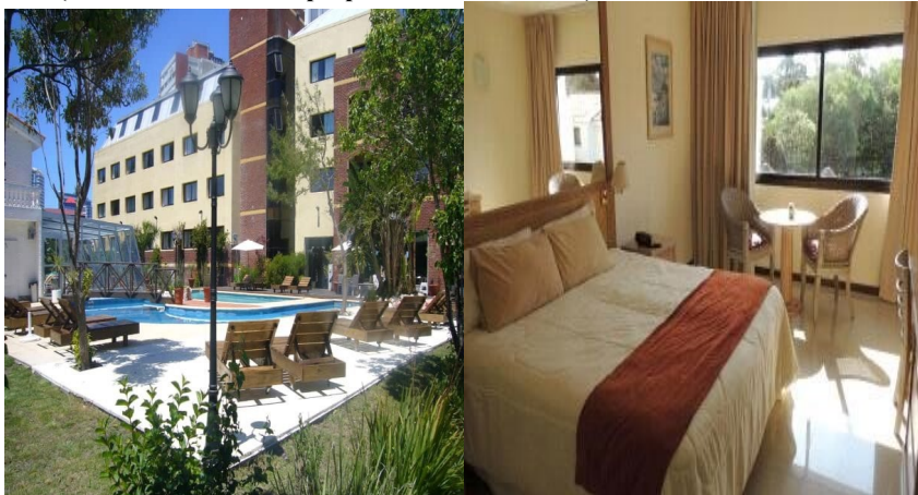
Hotel Marbella http://hotelmarbella.com.uy/