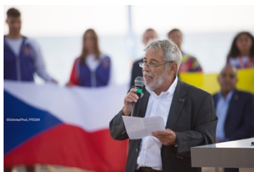
president of the FFESSM.

The 2026 General Assembly will be a key moment for dialogue and decision-making on a wide range of topics and themes: international cooperation, development of practices, safety, innovation, sustainability, and the promotion of underwater sports.