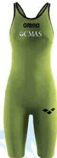
- Carbon PRO Closed back - Carbon PRO Open back