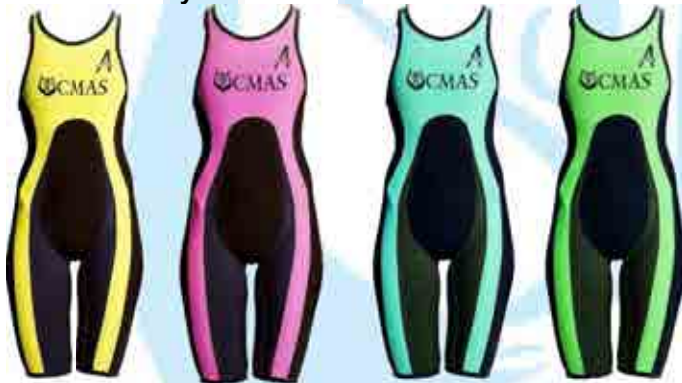
My Skin iO Finswim Full Knee