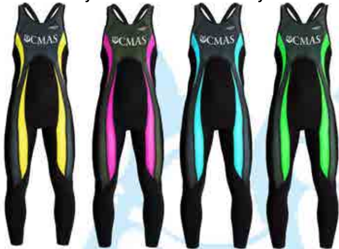
My Skin iO Finswim Full Body