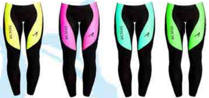
My Skin iO Finswim pants